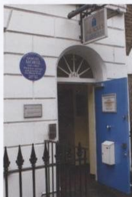
Front entrance to the All Souls Clubhouse

A smaller, more intimate meeting room (also ideal as a break-out room accessible from the Upper Room) our Yellow Lounge is adjacent to the Upper Room. Seating up to 10 in a meeting-style configuration, the lounge's comfortable surroundings provide an ideal venue for meetings.